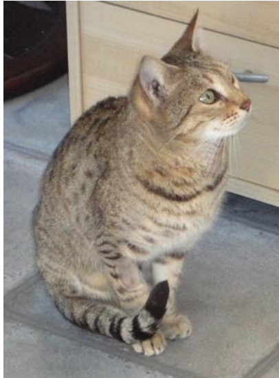
Two year old tabby female TIGGER is affectionate, inquisitive and playful.

These cats are all looking for new homes. If you think you can help, please call the Cat Rehoming line on 0118 9010701