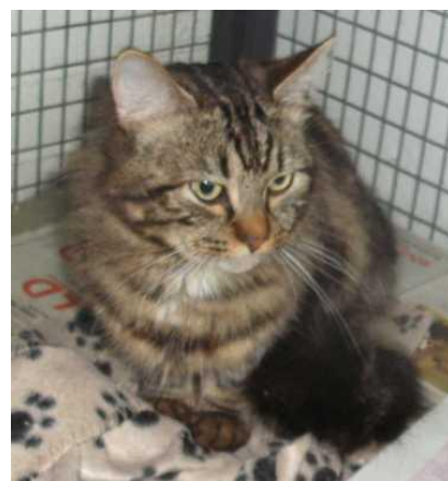
Two year old male SNUGGLES is a calm and friendly long-haired brown tabby.