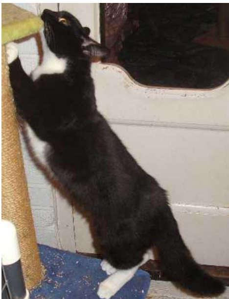
Black and white male kitten HENRY is 6-8 months old, very sweet, friendly and playful.