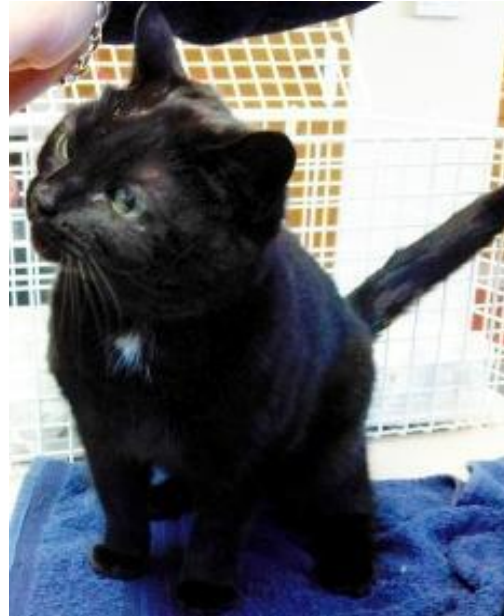
Five year old black female SOOTICA is friendly and looking for a good home.