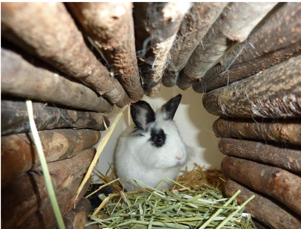
Humbug, handed in to local vets at the end of February and rehomed within 3 weeks (the quickest ever!).

It is recommended that the preparation of a Will is entrusted to a solicitor.