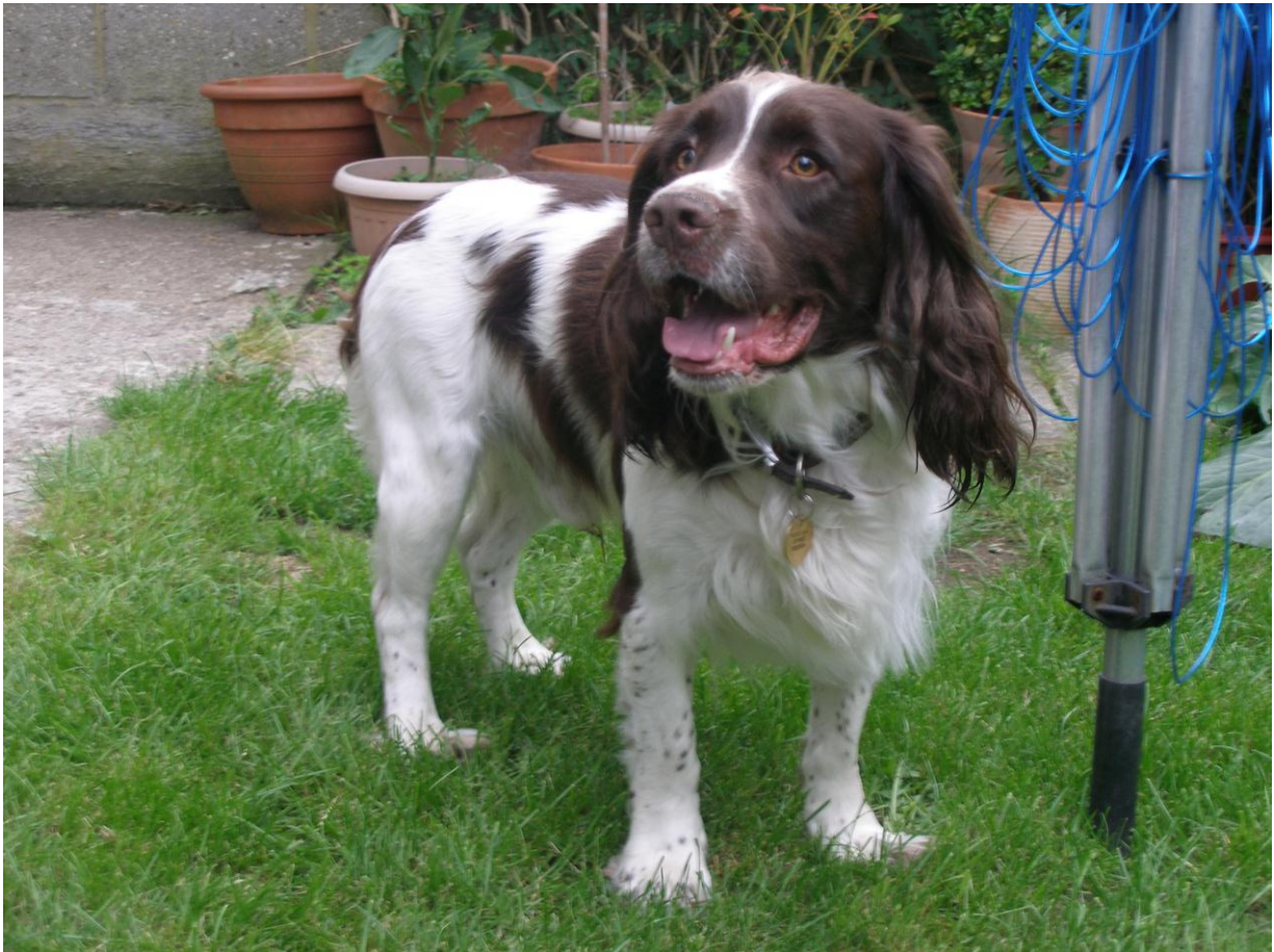
Logan, a 3 year old Springer Spaniel. His owner became ill and could no longer look after him but we were able find a new home for him.